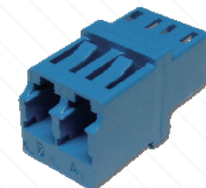
LC SMDX Adapter (Asymmetric)