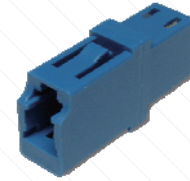
LC SMSX Adapter (Asymmetric)